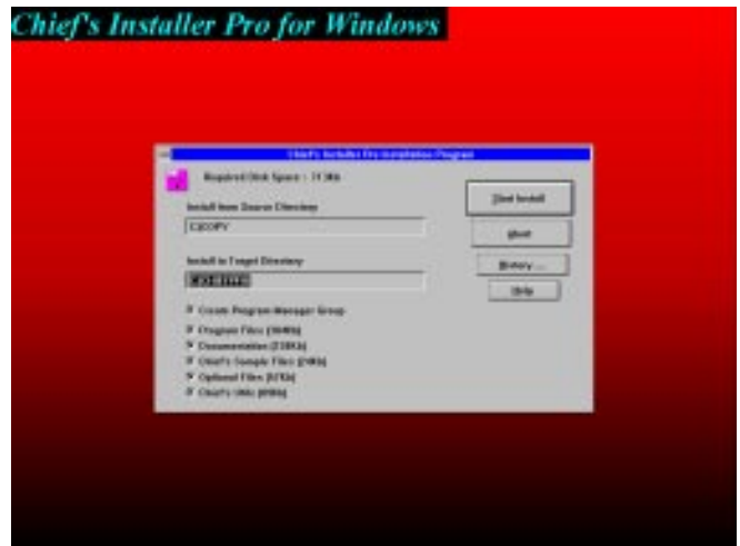
Main installation screen with the now obligatory colour fade background!

And then there's the UNINSTAL.EXE, which can be used to uninstall any program that was installed with The Chief's Installer Pro. Note that you have to set an option in WINSTALL.INF to generate an UNINSTAL.LOG file that is needed to uninstall your application. Of course, your application will be so good that nobody would want to uninstall it, but it's a very nice feature to have available!